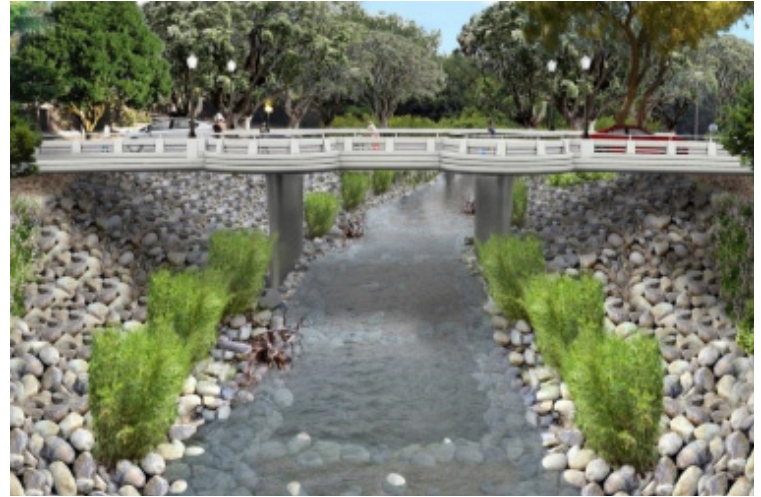
Rendering of Pope Chaucer Bridge, connecting the cities of Palo Alto and Menlo Park.