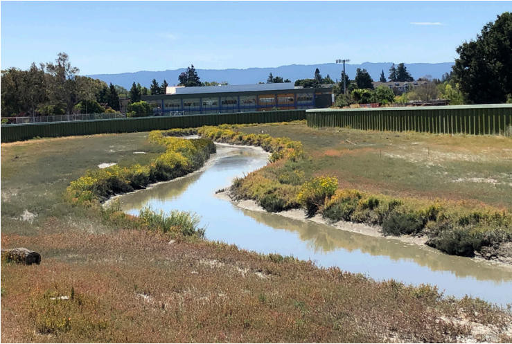
San Francisquito Creek floodwall, August 2019.