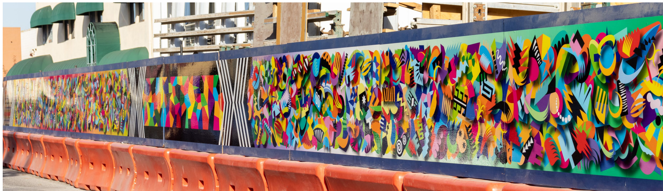
Temporary mural by Oree Original for Ash St