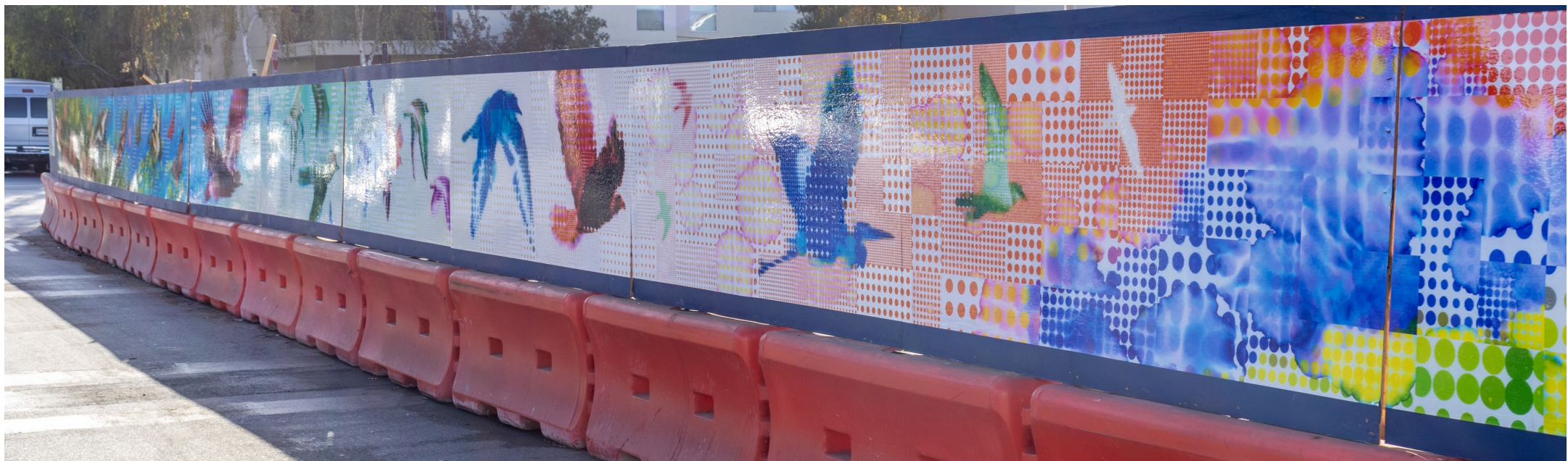
Temporary mural by Phillip Hua for Birch St