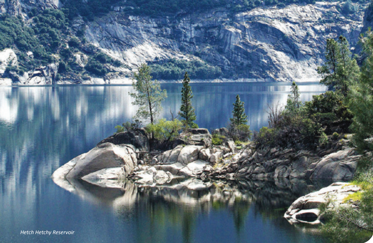
Hetch Hetchy Reservoir