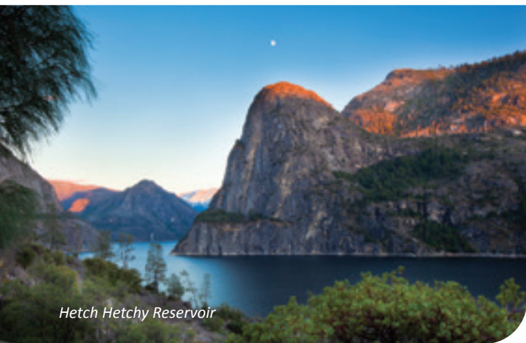
Hetch Hetchy Reservoir