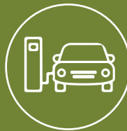
Electric Vehicle Chargers