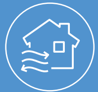
Door and Window Insulation

These upgrades would apply to common areas such as lobbies, community rooms, shared attics, hallways and outdoor spaces (dependent on availability of funding).