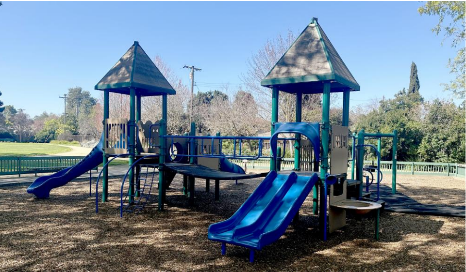
Existing Tot Lot Equipment