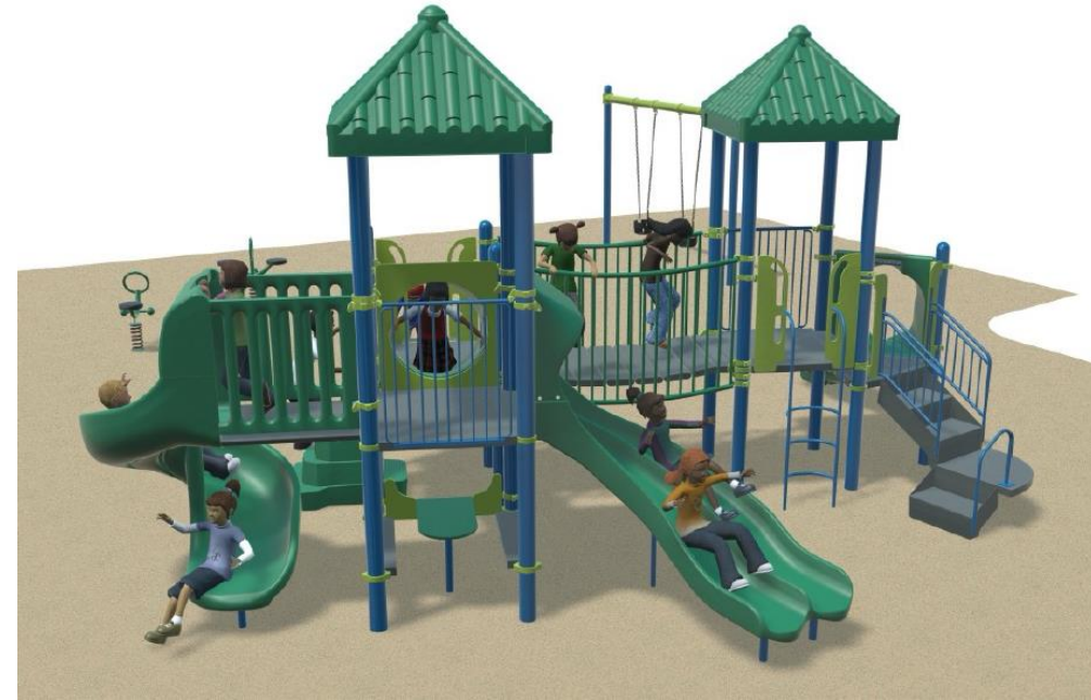
Proposed Tot Equipment