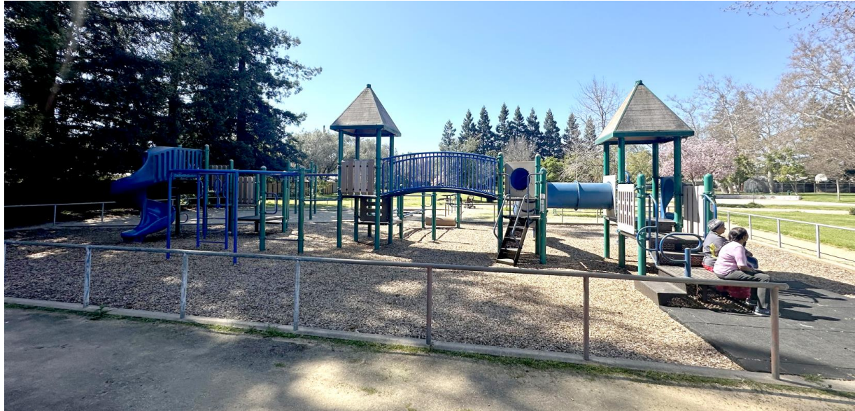
Existing Playground Equipment