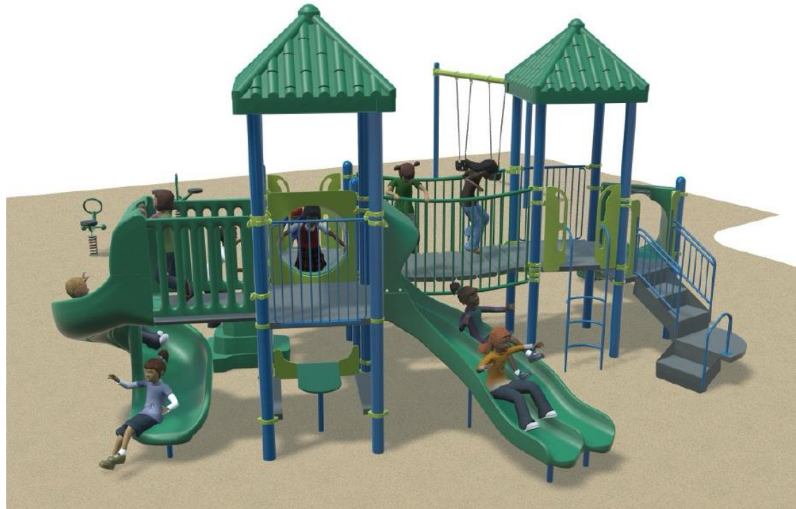
Proposed Tot Lot Equipment