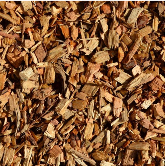
Play Mulch (Currently Used)