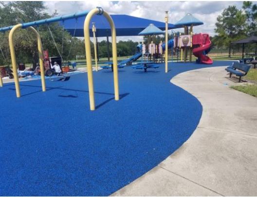
Rubberized Safety Surface