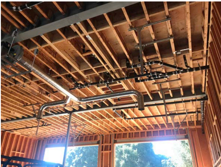
MEP rough-in at the Apparatus Bay.