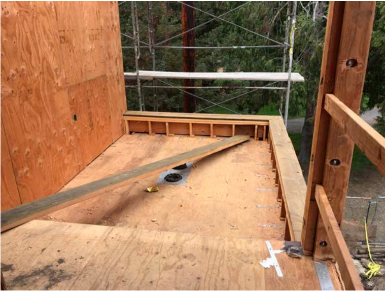
Second Story Balcony Framing.