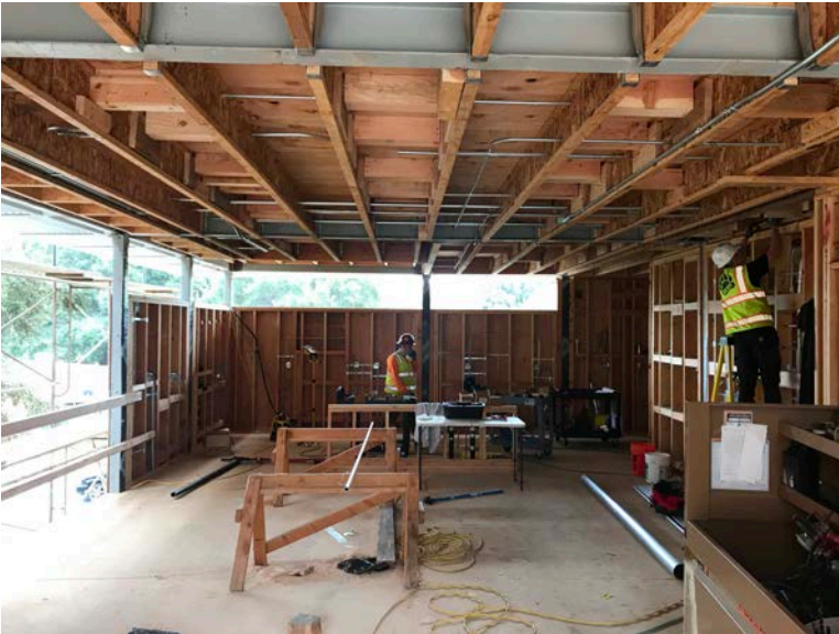
Second Story interior MEP rough-in.