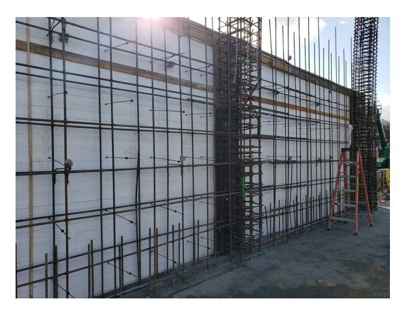
"Board form" cast-in-place wall being formed.