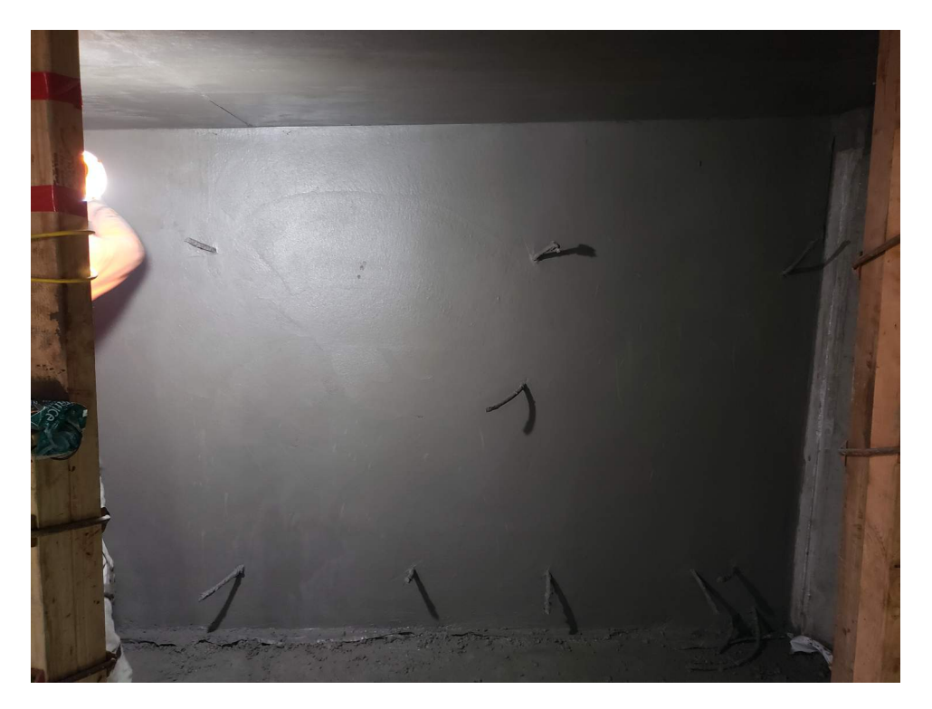
Shotcrete wall being finished. Grout injection tubes for waterproofing system shown in photo.