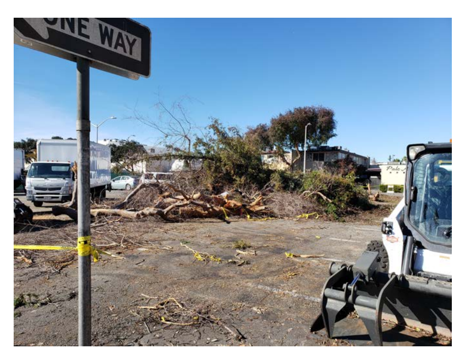
Tree removal and debris off haul at Lot C-6