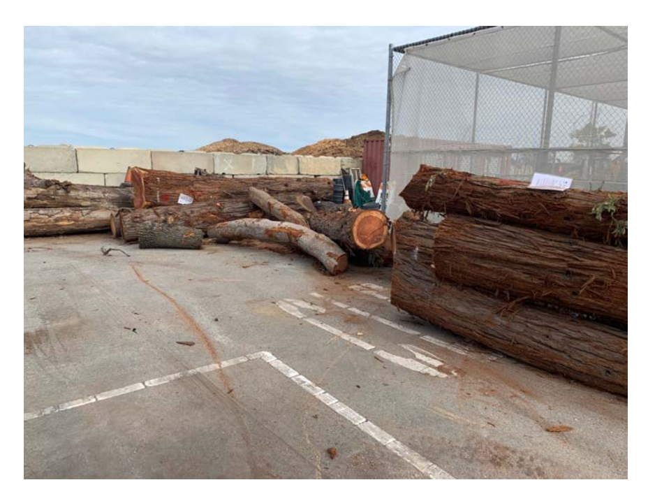
Salvaged logs from Lot C-6 and C-7.