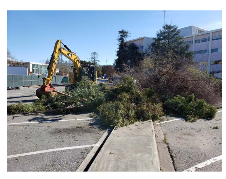
Tree removal at Lot C-6.