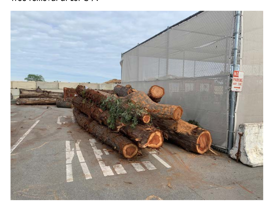
Salvaged logs from Lot C-6 and C-7.