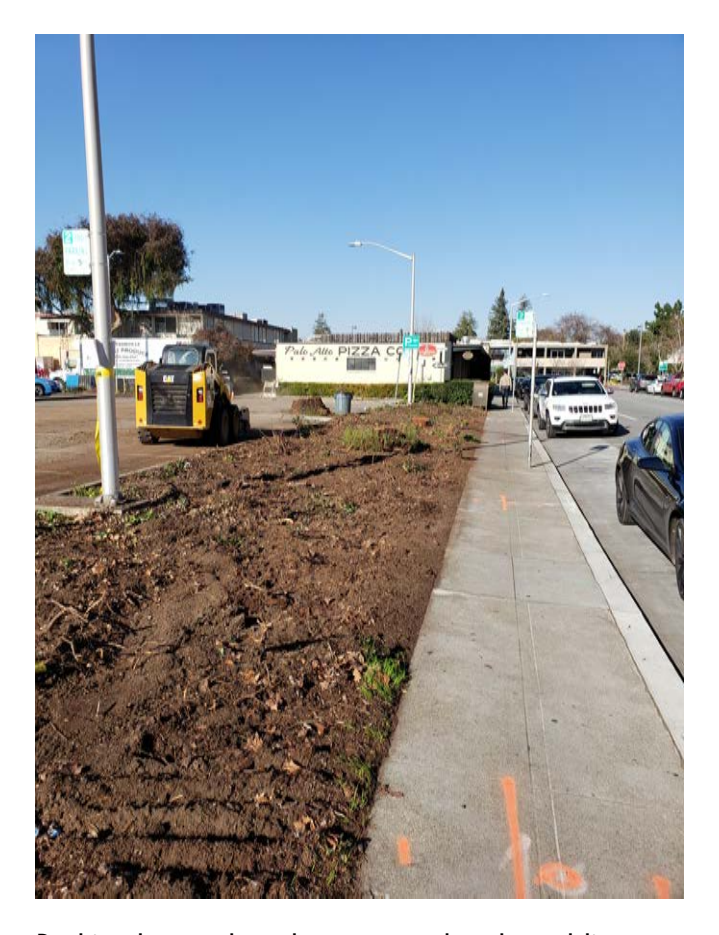
Parking lot ready to be reopened to the public.