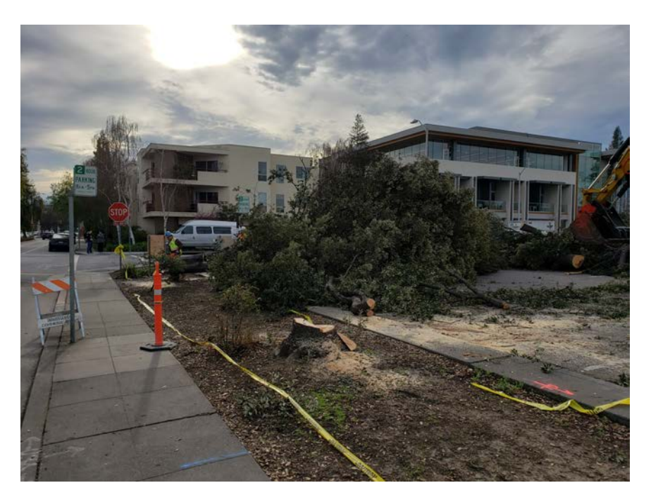
Tree removal at Lot C-7.