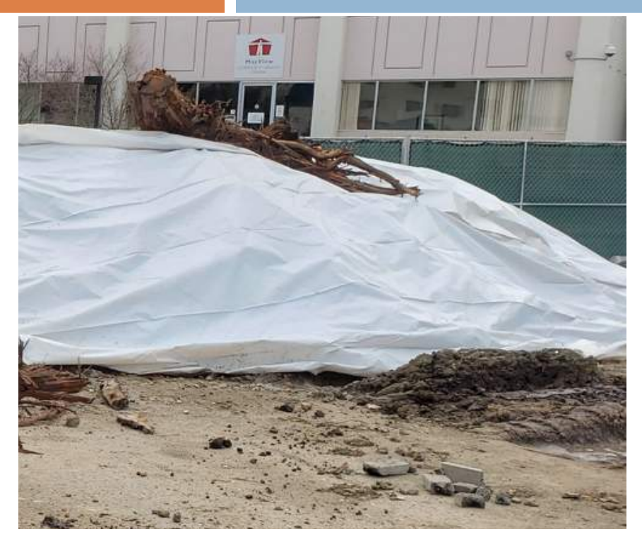
Off-haul of tree and demo debris.