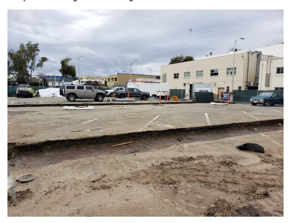
Compaction of subgrade at existing islands.