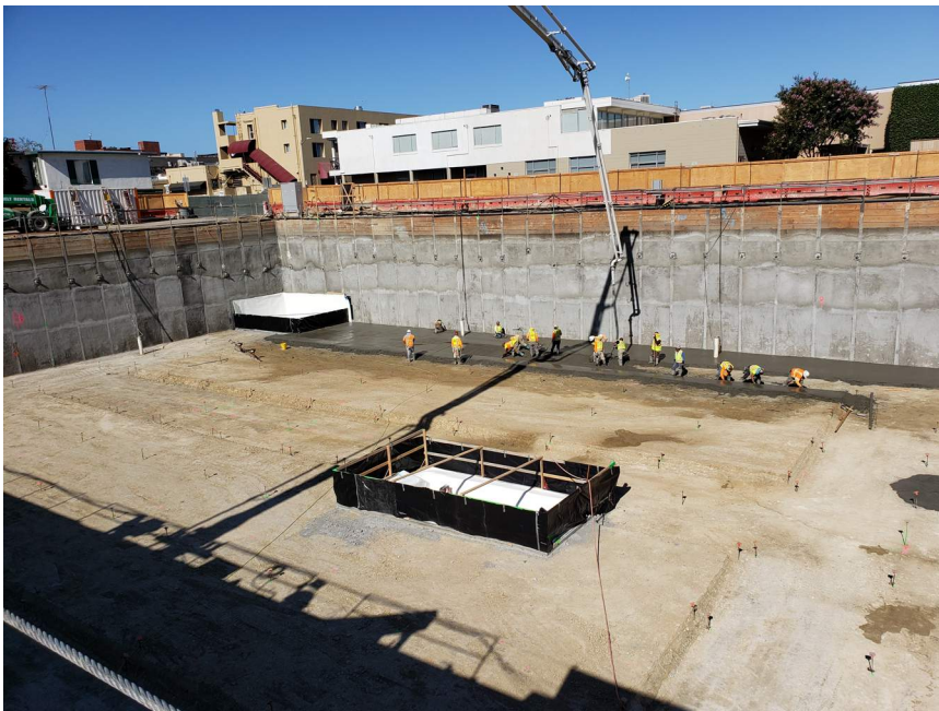
Elevator and mechanical pits waterproofed; rat slab being placed.