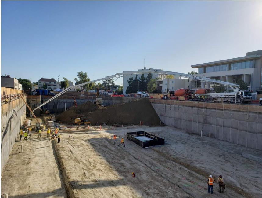
Concrete pump onsite for placement of rat slab.