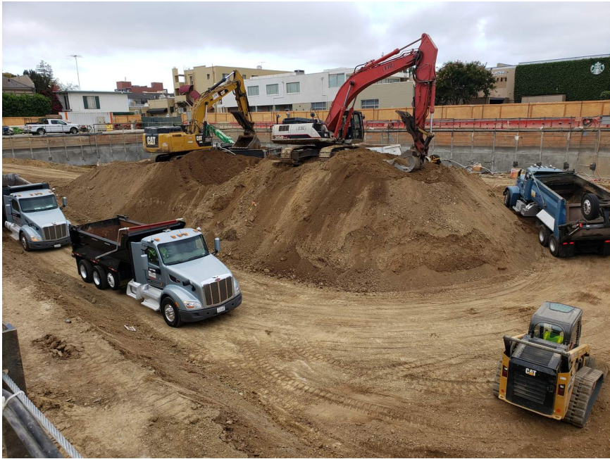
Mass soil excavation activities ongoing.