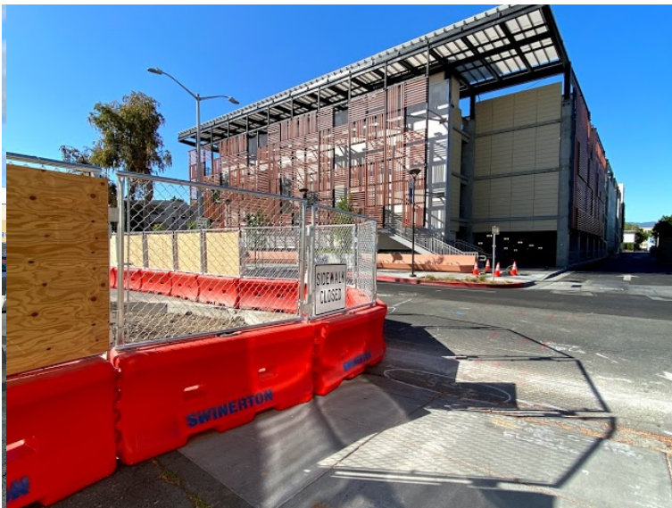
Site fence established.