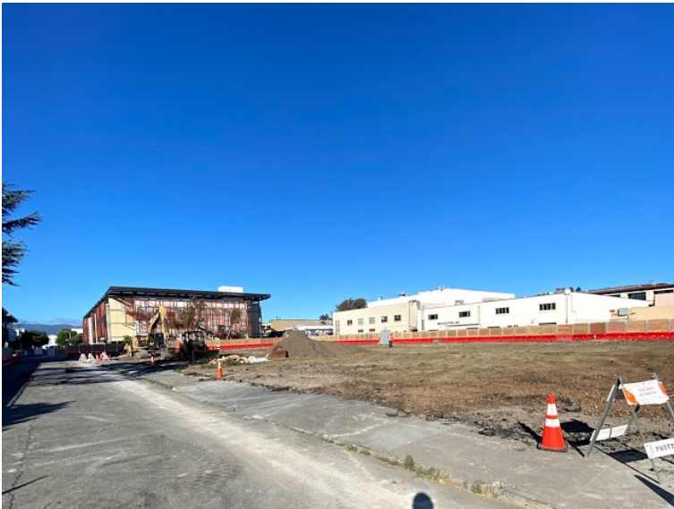
Parking lot demolition complete.