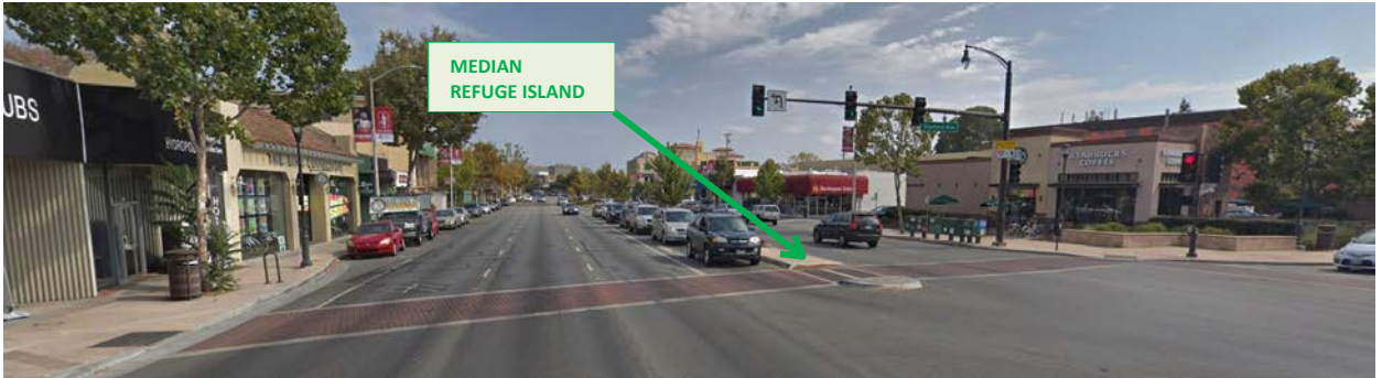
Median refuge island at Stanford Avenue and El Camino Real

Examples of median refuge islands can be found throughout Palo Alto as well as on the Stanford Campus.