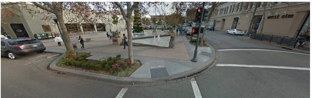
Intersection of University Avenue and Emerson Street