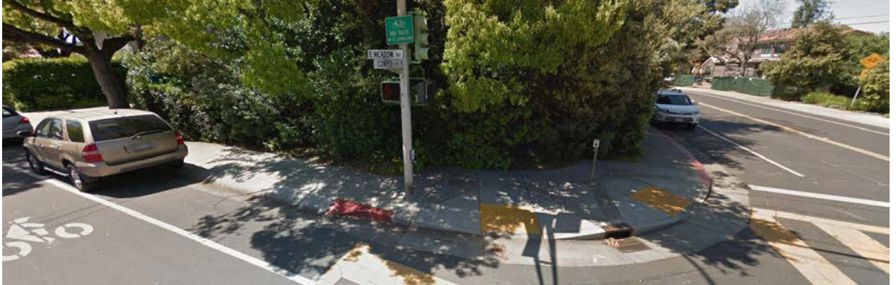
Intersection of E Meadow Drive and Cowper Street showing directional curb ramps

A: Curb extensions and bulb-outs at intersections extend the concrete sidewalk into the current roadway and allow for compliant ADA curb ramps. These features can be seen scattered throughout Palo Alto.