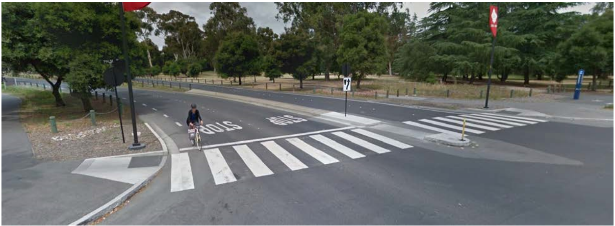
Median refuge island on Stanford Campus

Q. Did the City conduct a public outreach process for this project?