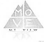
EXHIBIT A: SITE TERM SHEET

NAME OF OWNER: Congregation Etz Chayim Palo Alto ("HOST")