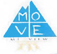
EXHIBIT A: SITE TERM SHEET

NAME OF OWNER: Highway Community Church Palo Alto ("HOST")