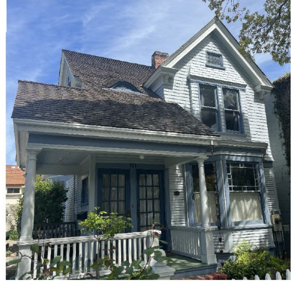
Figure 2: 2023 Reconnaissance Survey photograph.