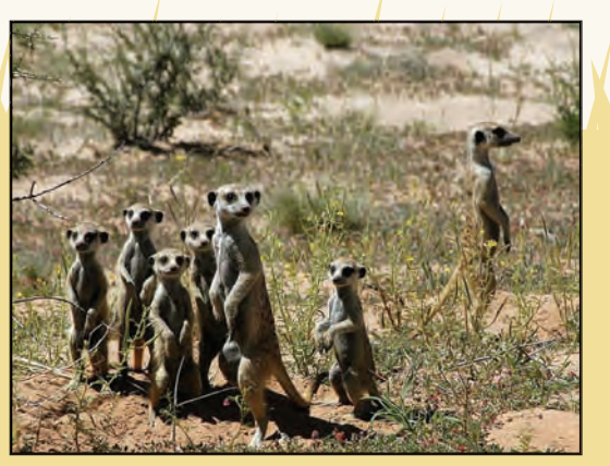
A group of meerkats in the wild