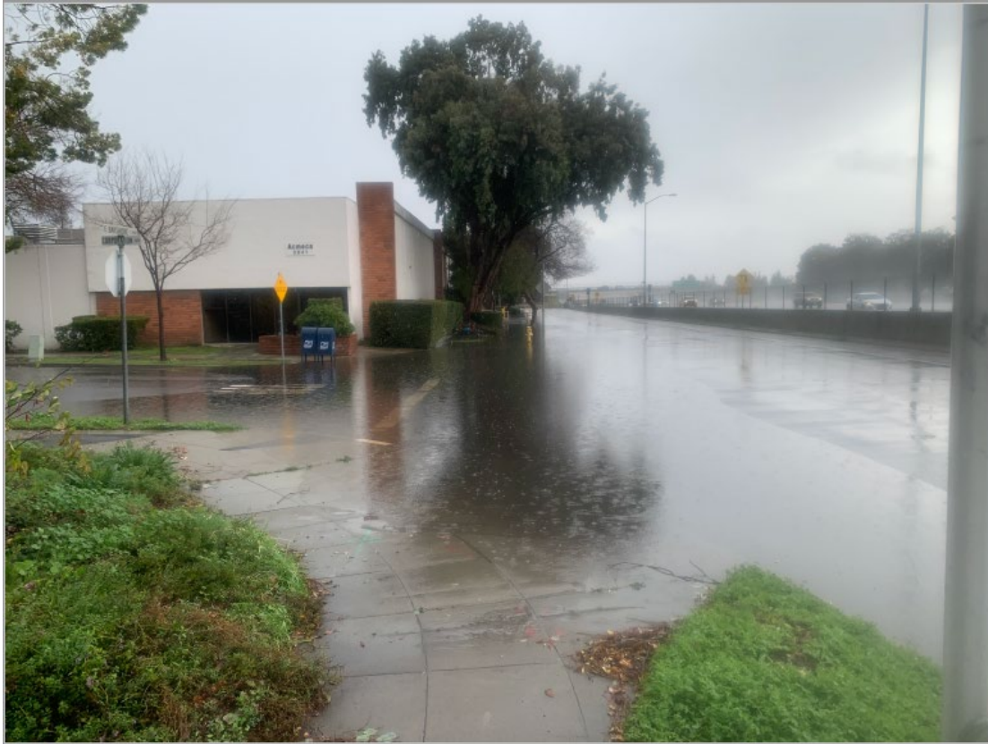
JAN 2023 AT EAST BAYSHORE ROAD