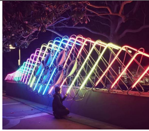
Two of eight temporary installations from the 2017 Code:ART festival that drew approximately 10,000 visitors to downtown Palo Alto over three days, animating underutilized alleyways and spaces. The planned Code:ART2 festival has been postponed to October 2021.