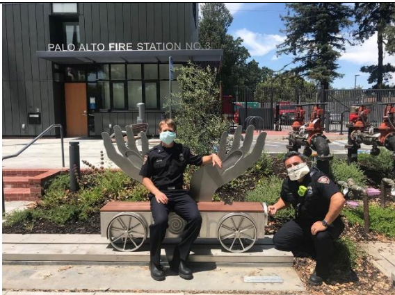
Welcome Wagon , 2019 by Pete Beeman is the most recently installed permanent artwork at the new Fire Station 3. The artist worked closely with Fire Department staff on the design development for a kinetic bench

The City's first acquisition of a permanently sited outdoor sculpture, Nude in Steel was originally temporarily exhibited in front of the Palo Alto City Hall. Installed at its current site in front of Rinconada Library in the 1990s, the sculpture has welcomed generations of library visitors and occasionally is found with a flower tucked behind her ear.