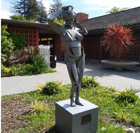
Nude in Steel , 1976 by Hans Wehrli

The City's first acquisition of a permanently sited outdoor sculpture, Nude in Steel was originally temporarily exhibited in front of the Palo Alto City Hall. Installed at its current site in front of Rinconada Library in the 1990s, the sculpture has welcomed generations of library visitors and occasionally is found with a flower tucked behind her ear.