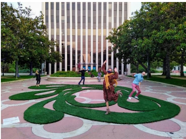
King Plaza has been the site of ongoing temporary public art installations since 2015, inviting visitors to visit the plaza and experience something new. The current installation titled Bucolic Labyrinth by Paz de la Calzada features an audio guide for those seeking instruction on how to walk a labyrinth.