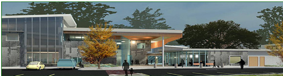
Approved design for the new Mitchell Park Library and Community Center by Group 4 Architecture

The City also made significant progress on its library renovation projects. The historic renovation of the College Terrace Library and adjoining childcare center was completed, and the library reopened on November 9, 2010. Construction of the new 56,000 square foot Mitchell Park Library & Community Center began in September 2010 and is scheduled to be open in the summer of 2012. A temporary Mitchell Park Library opened to the public in June 2010. Work is underway on the renovation of the Downtown Library which is scheduled to reopen in the summer of 2011.