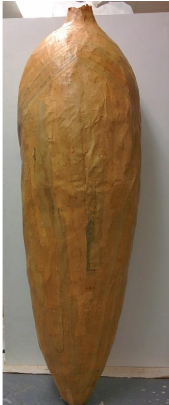
Pod V (Pupa) , 1992 Brown paper, glue 60”h x 17”w x 13”d

Pod V (Pupa) is the fifth hanging pod that was created during the artist's residency. This pod represents the trunk or branches of the tree form. Although the initial intention of this series was to suggest cloaks, this pod takes the form of a pupa or cocoon.