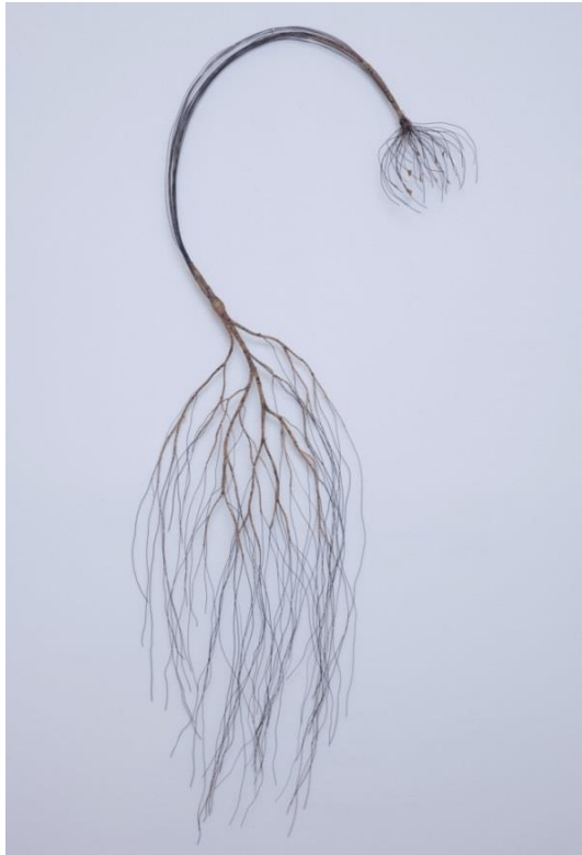
Kokopelli , 2010