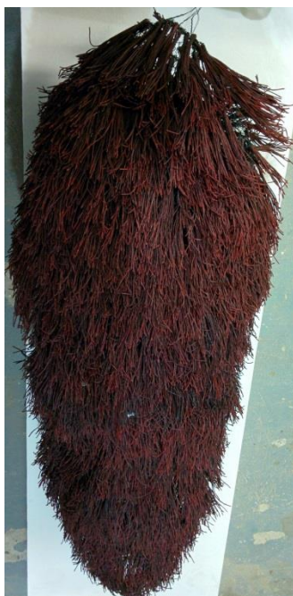
Pod I (Eve) , 1990 Garden ties, wire, paint 62" h x 20" w x 13" d

Pod I (Eve) is the first of five hanging pods that were created in the beginning of Chinen's residency in the City of Palo Alto's Cubberley artists' studio program. The intention was to have each of these pods represent a different part of the plant form, loosely taking on the shape of cloaks, hence the human scale.