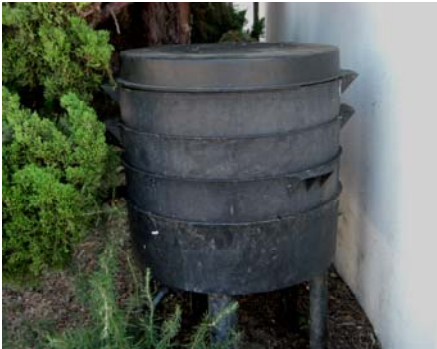
Food scraps from employee lunches are composted in a worm bin

As you walk to the front entrance of the Peninsula Conservation Center (PCC), where Acterra is housed, you are greeted with many signs of an environmental organization that “practices what they preach.” A rack full of bicycles, a worm bin for composting employee food scraps, drought tolerant plants, a mini herb and vegetable garden, a picnic table made from reclaimed wood, and a meter showing the energy being produced from the 2.4 kilowatt solar rooftop system.