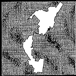
Exhibit A 4329 El Camino Real

This map is a product of the City of Palo Alto GIS