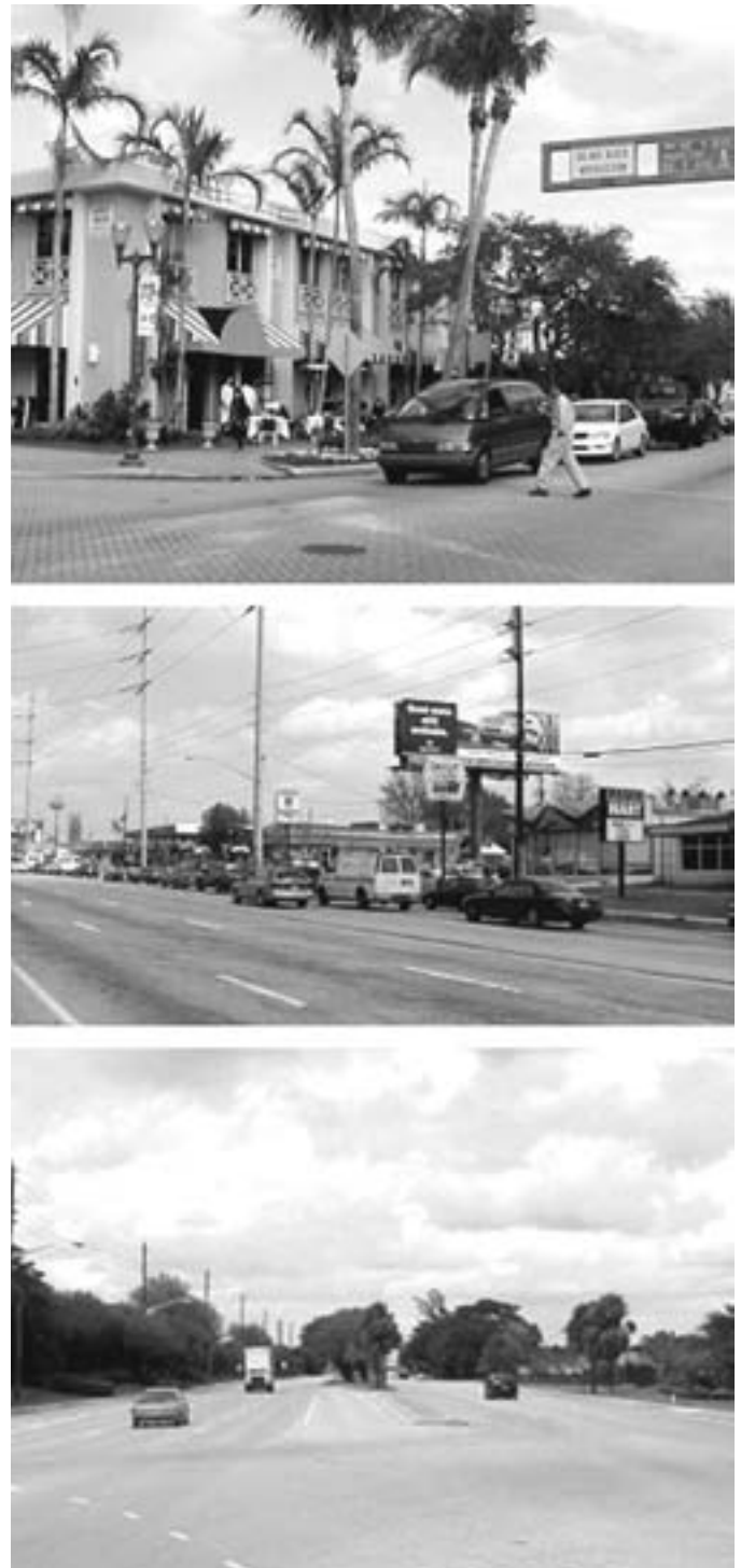
Figure 3. Three urban minor arterials.

relationship between driver behavior and transportation safety, as well as to enhance our overall approach to the design of urban roadways. This study thus concludes with the hope that by better understanding the relationship between design, driver behavior, and safety, we can design roadways that are not only safe, but also livable.