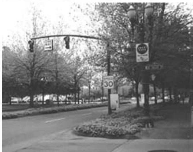
Figure 1. Livable streetscape treatments: urban amenities or roadside hazards?