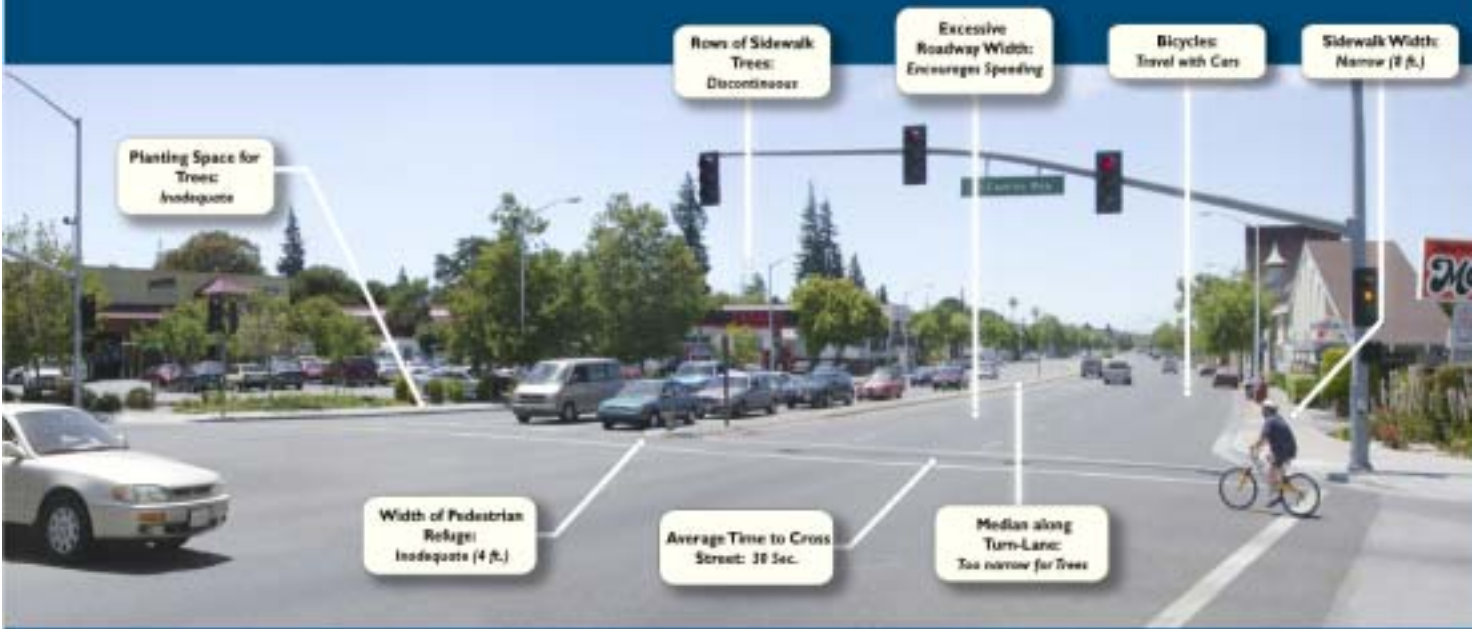
El Camino Real @ Los Robles / El Camino Way - Existing