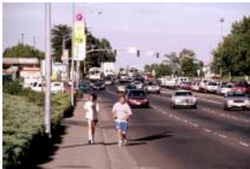
Freedman Tung & Bottomley

Real enhancement of arterials is meaningfully implemented through publicly funded capital improvements and re-tuning of policies that shape private development. Regulations working in concert, can shape the public right-of-way and the private properties along it into a corridor where all the parts relate to each other, creating a unified whole. The corridor can be developed with a unique identity rather than being left as a wide, ugly strip of asphalt. It can be made into a “piece of city” that serves as an armature for connecting adjacent neighborhoods and districts rather than being an unpleasant necessity. Well designed boulevards and parkways can help to make the experience of moving through the city understandable and memorable. The alternative is to hold these corridors hostage to a one-sided widening approach that while increasing capacity, often scrapes away curbside parking, harms front-