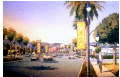
Freedman Tung & Bottomley

Top: Hegenberger Road, Oakland, California. Between I-880 and Oakland Airport, prior to the Airport Area Gateways program developed for the Port of Oakland, and the cities of San Leandro and Oakland. Planter strips with trees and streetlights were added to buffer walkers from traffic; pedestrian-scale ornamental street lights were added to the boulevard.