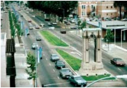
Freedman Tung & Bottomley

Residents involved in our North Area corridor revitalization program in San Leandro, California wanted to distinguish their segment of East 14th Street. A gateway arch now marks the San Leandro-Oakland border, terminating a view corridor sequence that begins at the civic center. Arch design was drawn from local WPA-era public buildings including City Hall and the Veterans' Memorial Building.