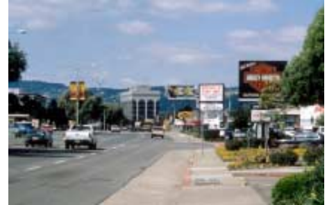
Freedman Tung & Bottomley

The arterial corridor, like much of suburbia, is a recent iteration of a settlement pattern that originated less than 100 years ago. Hopefully, we are beginning to reshape our suburban towns and cities into communities with an increased focus on livability and improved understanding of town form. ■