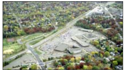
Design Center for Am. Urban Landscape