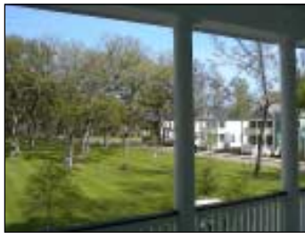
Habersham, Beaufort County, Georgia