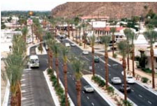
Freedman Tung & Bottomley

Streets must have spaces and elements designed for both automobiles and pedestrians. For example,