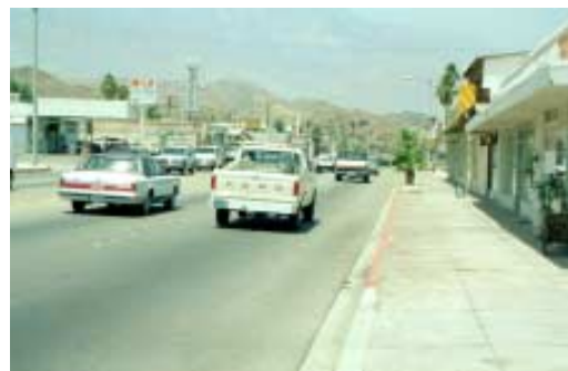
Freedman Tung & Bottomley

Hierarchy and sequence create recognizable structure and visual order. People are most attracted to places with a sense of approach, arrival, and departure. Segments of arterials need to be defined by regularly spaced elements repeated to